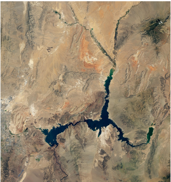
Lake Mead, August 7, 2000 and August 9, 2021